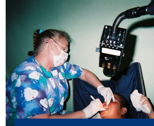
Thank you to all of our faithful dental clinic volunteers!

The familiar sight of a truck all packed up to go to a mobile dental clinic.